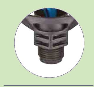
Threaded Inlet Connection For connectivity with assembly 1/2" male threaded inlet connection is available

Color codes for identification Color coded nozzle are available for different flow rates.