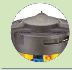
Hermetically-sealed silicone chamber Hermetically-sealed silicone chamber protects silicone from leakage